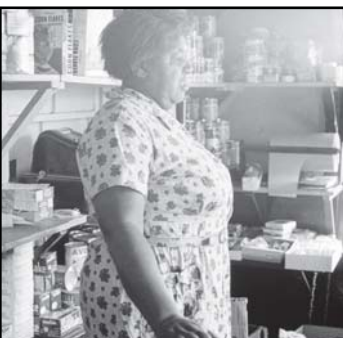
By the 1960s, the community was home to some 800 residents. The town had its own businesses – like this grocery store – a school and a church (Seaview United, above).

Community at the Edge Once the site of a historic Black Canadian community on the outskirts of Halifax, Africville was demolished in the 1960s and its people relocated. Africville is now a symbol to Black Canadians of the need for vigilance in defence of their institutions.