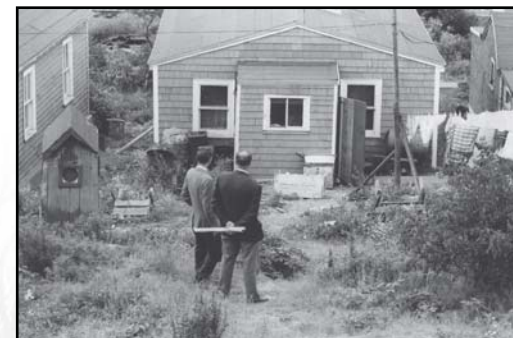
In the 1960s, a new bridge was planned between Halifax and Dartmouth, along with port expansion. Africville was in the way.

[Below] Today, Seaview Park is a place of pilgrimage for former residents of Africville and their descendants.