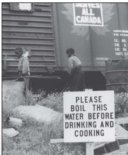
Africville was settled from the 1820s by African Canadians seeking work in Halifax. In the 20 th century, as a town without water or services, it was an emblem of Black settlement at the periphery of white society.

Community at the Edge Once the site of a historic Black Canadian community on the outskirts of Halifax, Africville was demolished in the 1960s and its people relocated. Africville is now a symbol to Black Canadians of the need for vigilance in defence of their institutions.