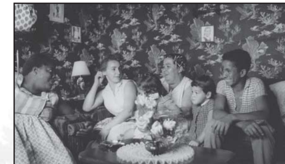
The people of Africville – who despite difficulties had together created a cohesive community – were relocated to social housing between 1964 and 1967.