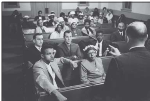
Despite protests – this one in the Seaview United African Baptist Church – the community was dismantled. A campaign for redress has emerged.