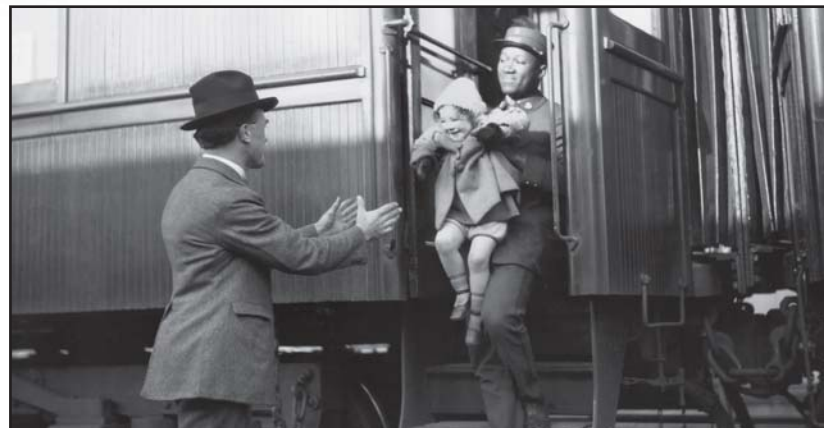
Labour The Railway Porters Union consisted mainly of Black members. They fought valiantly – and successfully – to improve labour conditions for their profession.