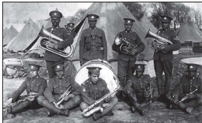
Service During the First World War, after much advocacy on their part, Black Canadians were recruited for the No. 2 Construction Battalion; the band is shown here. It was the first all-Black regiment raised in Canada.

Au 20 e siècle, plusieurs Canadiens de race noire ont fait partie d'une série de désignations de personnages, de lieux et d'événements historiques nationaux. Ce sont des personnes qui ont contribué à forger le tissu social canadien par leur courage, leur idéalisme et leur talent.