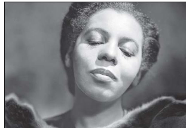
Music Portia May White (1911-65), who began singing in her father's church choir in Halifax, went to New York in 1941 and caused a sensation with her extraordinary voice.